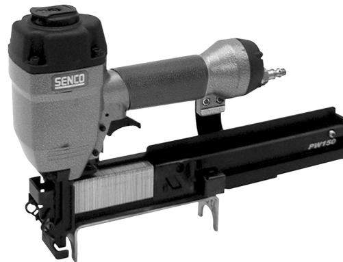
Staple Gun for stapling Onix, RadiantPEX, and WaterPEX.

5. Before beginning the installation, please refer to the plans supplied by Watts Radiant or its representatives with all associated design information. We recommend you read all appropriate Watts Radiant Installation Manuals and Guidelines before beginning.